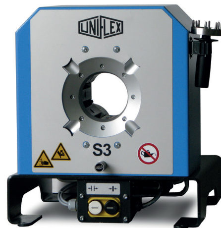
Image shows S3 DC without power unit