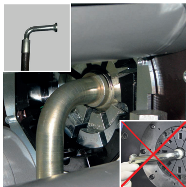
The S3 series can be used to crimp short 90° elbow fittings with a long drop. This is impossible for other conventional machines.