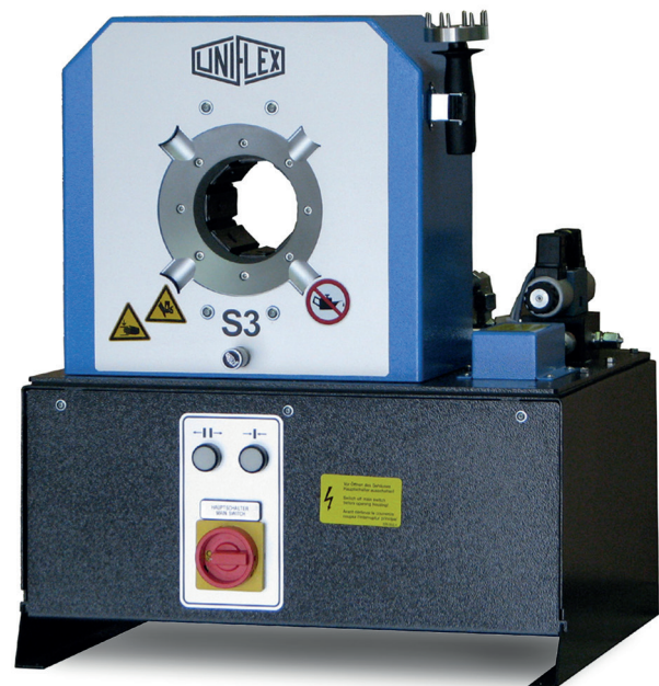
Image shows S3 ECOLINE